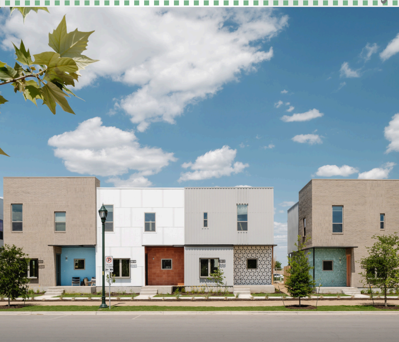
Laurel Creek Apartments